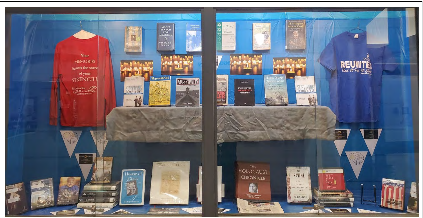
In Kouts, we were able to show our support with the help of a patron who had traveled with Eva Kor.