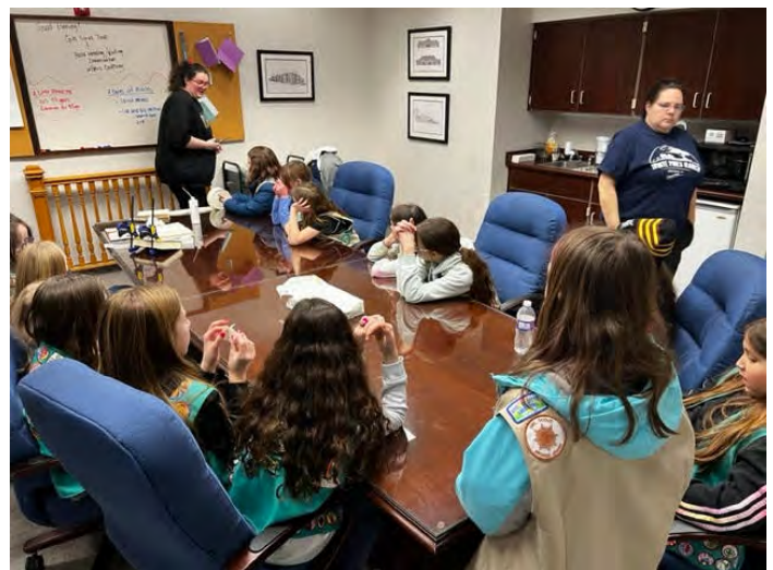
The Girl Scouts toured the Valpo branch and had a blast with all of the new toys and furniture in the Youth Services department.