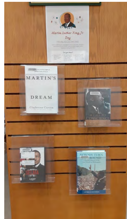
Hebron had several profound books (and a movie) to