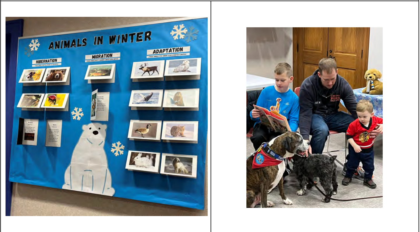
Hebron is taking some time to learn more about what different animals do in the winter. Hibernation sounds like fun.