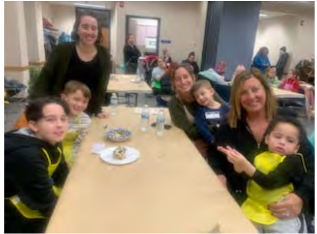
Chef Jr. was a huge fun food-making hit in Portage, we packed the room!