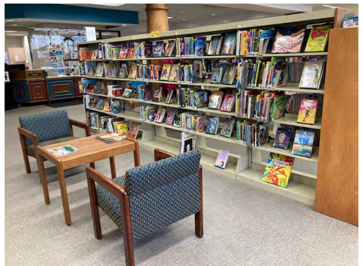
New materials have moved to a new spot in Valpo Youth Services, where there is plenty of room for browsing along with a spot to read and relax!