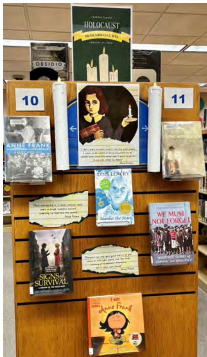
Hebron lit a candle for International Holocaust