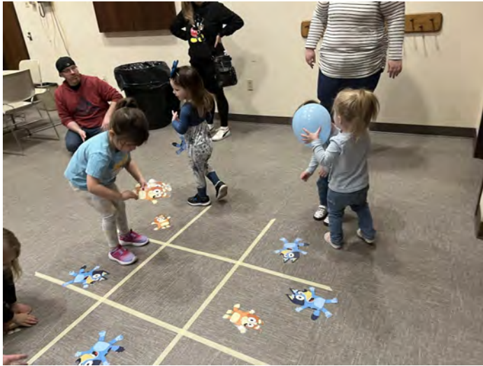
We had fun with Bluey in South Haven!