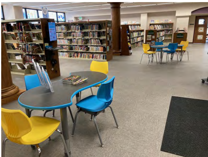
The Valpo Youth Services department got new tables, and they even came in PCPLS colors- blue and yellow!