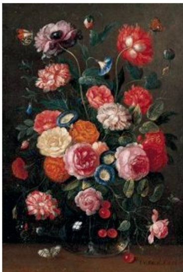
Still Life by Jan van Kessel the Elder, c. 1676. oil on copper. Stolen from the European Fine Art Foundation in Maastricht, Netherlands