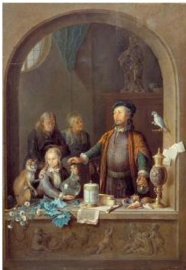
The Apothecary by Willem Van Mieris. c. 1720. Oil on wood. Stolen from Pharmacy Museum in Basel, Switzerland