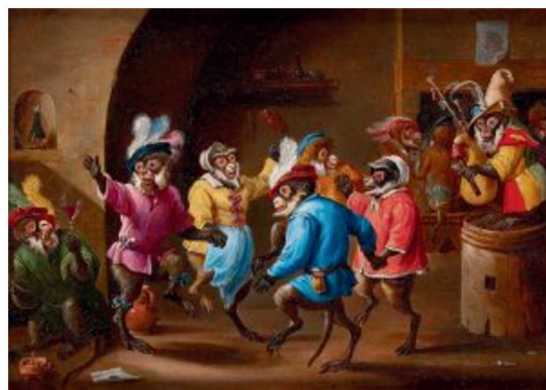
Festival of Monkeys by David Teniers the Younger, c. 1630. Oil on copper. Stolen from the Thomas Henry Museum in Cherbourg-en-Cotentin, France