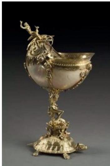
Chalice, c. 1590, silver & nautilus shell. Stolen from the Art & History Museum in Brussels, Belgium.